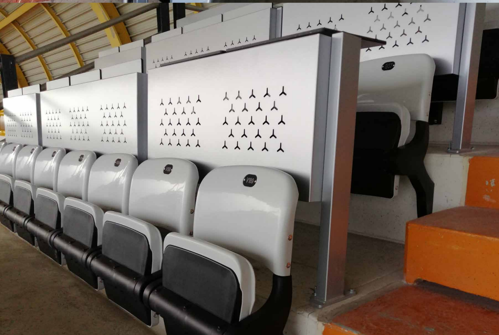
"GUIDO TEGHIL" STADIUM - LIGNANO SABBIADORO - PORDENONE, ITALY