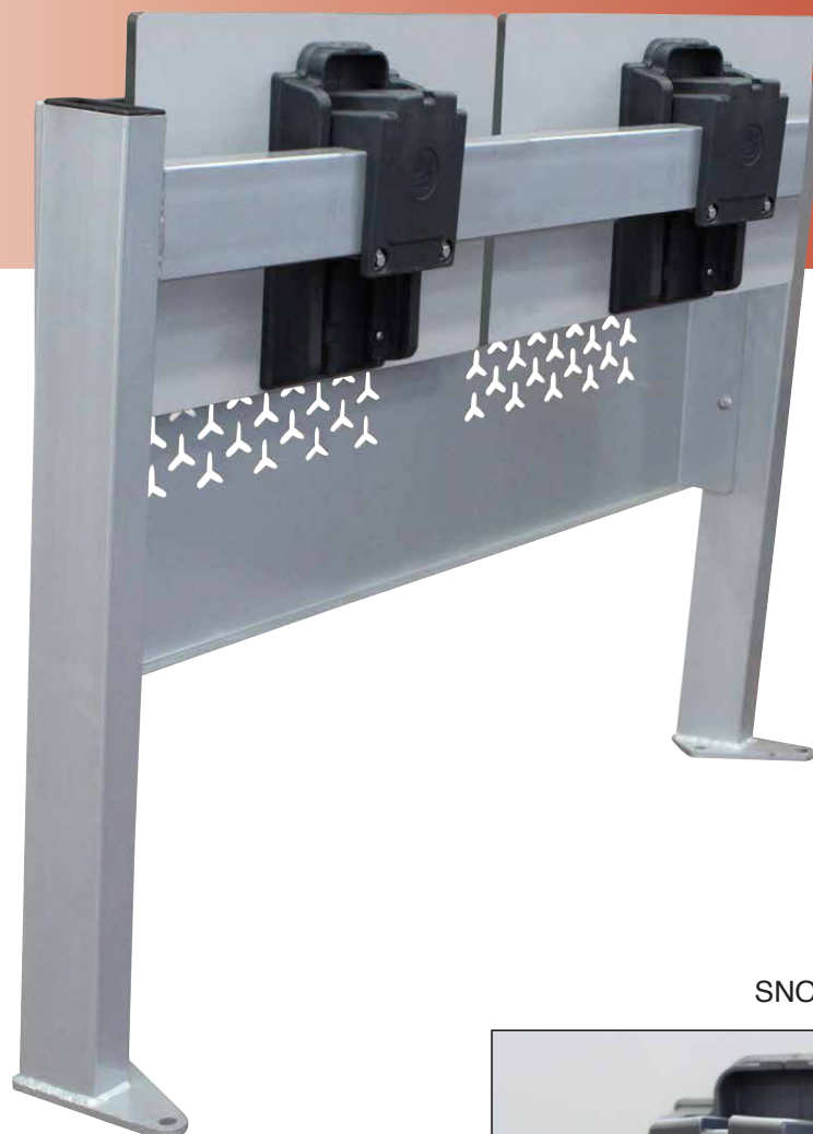
SNODO IN POLIAMMIDE